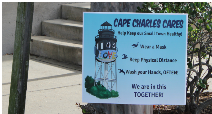
A sign next to a hand sanitizing station in Cape Charles, Virginia, reminds people how to keep their town healthy.

LQC approach lends itself well to potentially temporary solutions, such as sanitation stations, as well as unfixed infrastructure, such as moveable furniture. Implementing these quickly allows local leaders to try out different locations for the infrastructure and gather feedback from users on their experiences.